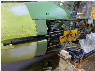
The gun mount