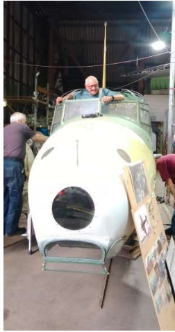
Two volunteers working on nose cone of Anson.