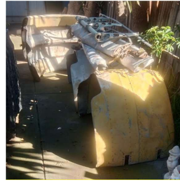
Oxford components retrieved from South Australian Aviation Museum