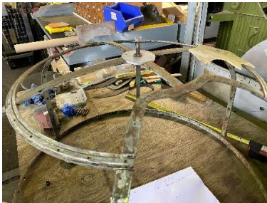
Part of the turret