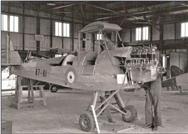
A7 is a DH60 Gipsy Moth at Parafield SA.